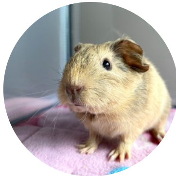
Mama Tot Baby