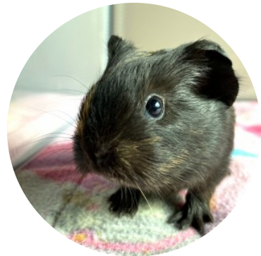
Mama Tot Baby