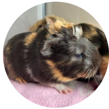
Mama Tot Baby