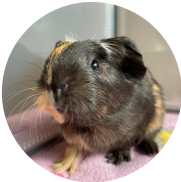
Mama Tot Baby